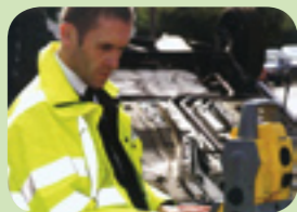
Safer to drive