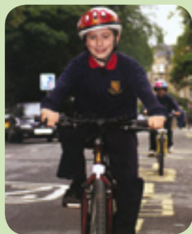
Safer to cycle