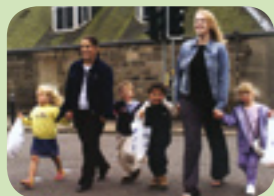
Safer to walk