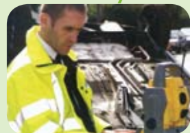
Safer to drive