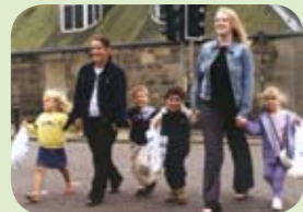
Safer to walk