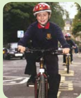
Safer to cycle