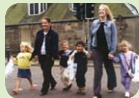
Safer to walk