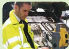
Safer to drive